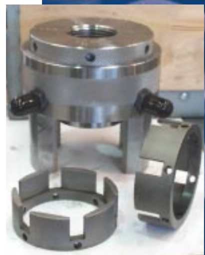
Hydracacs can be custom-made to suit specific applications.

3340-B Greens Road, Suite 605 Houston, TX 77032