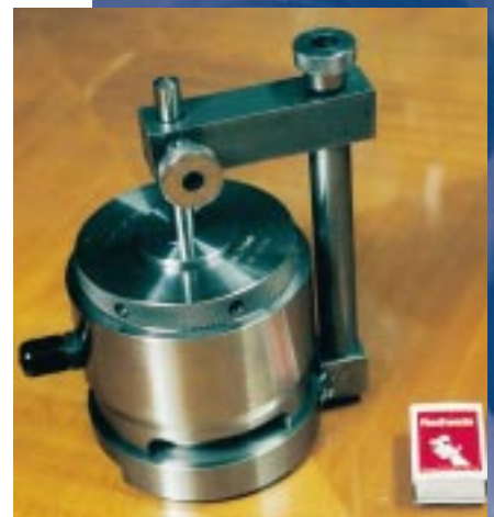
A specially designed HydraJac.