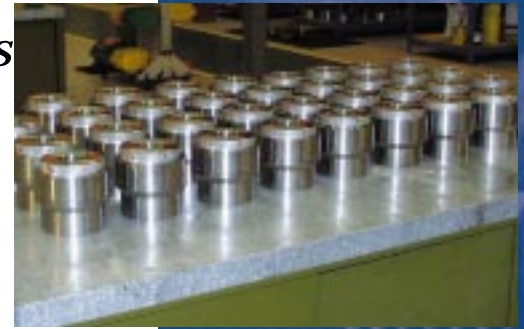
A2 Model HydraJacs

All HydraJac Stud Tensioners have exceptional working stroke length from a minimum of 15 mm for the smallest units.